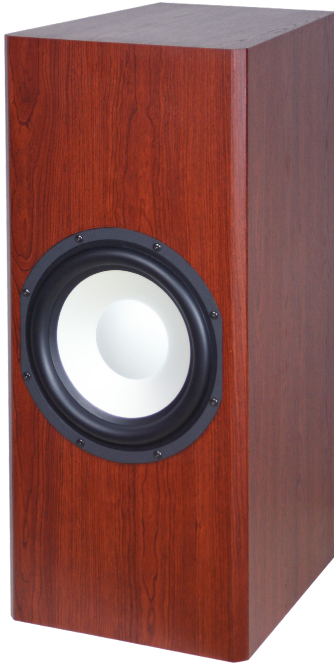
EP600 v4 Wireless Subwoofer