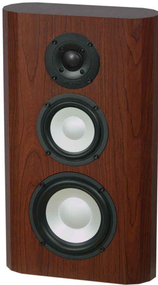
M5HP v4 On-Wall