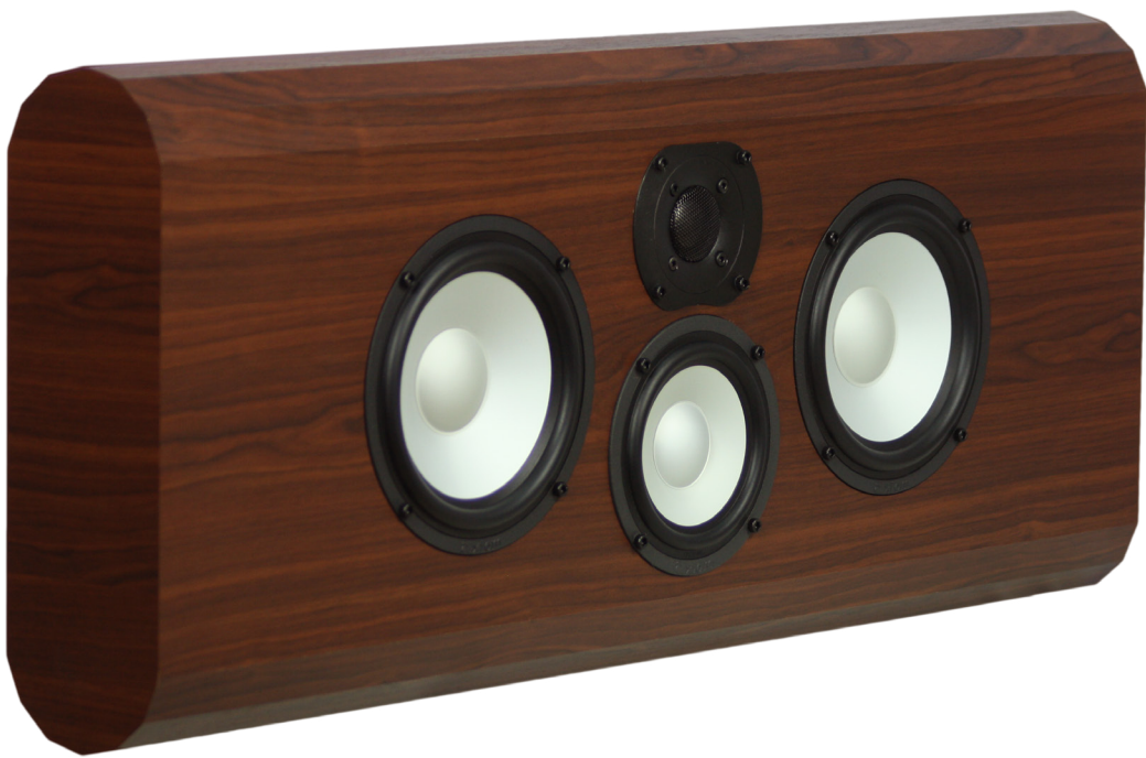
VP160 On-Wall Center